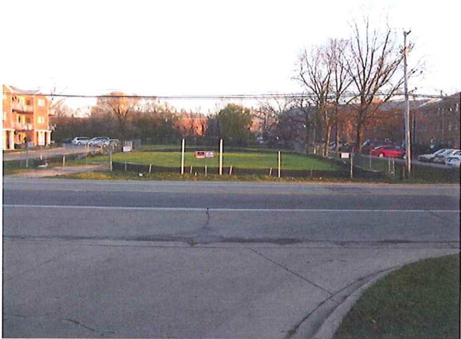
Front View of Subject Property