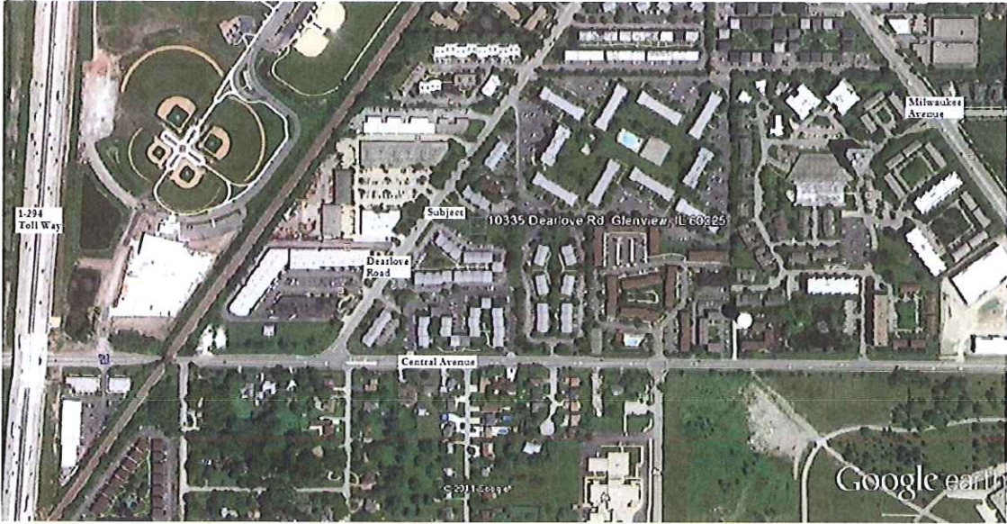
Aerial of Immediate Area